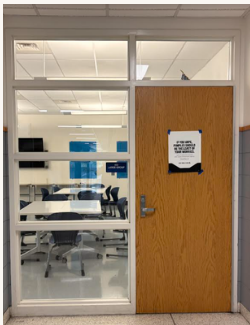
Sneak peak of the transformation