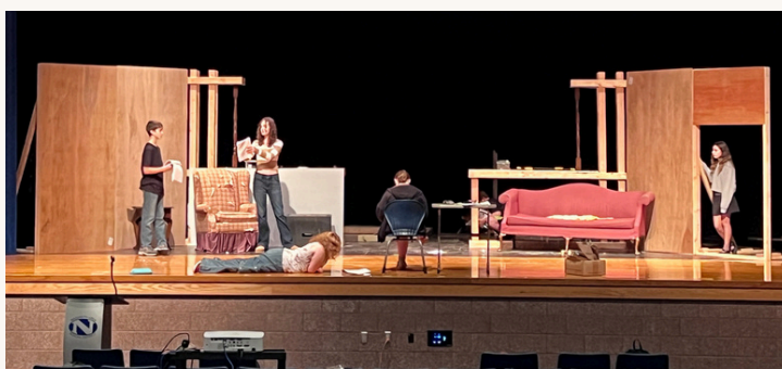
The cast and crew are working hard to make your nightmares come true in The House of Thrills & Chills .