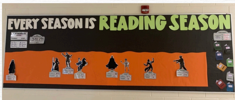
NAMS is striving to surpass 2.5 million reading minutes this school year.